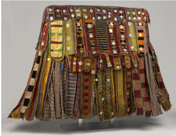
Yoruba "Egungun" Dance Costume, mid-20th century

Wood, cotton and wool textiles, aluminum, 55 x 6 x 63 in. (139.7 x 15.2 x 160 cm). Brooklyn Museum, Gift of Sam Hilu, 1998.125.